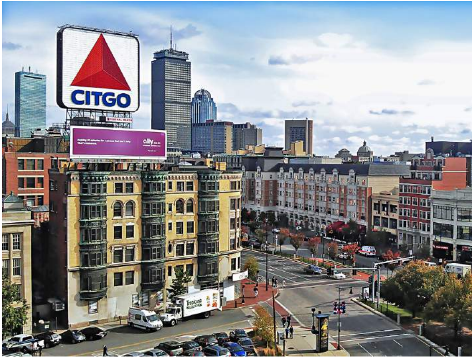
A view of the sign from Commonwealth Ave.

Located in the heart of Kenmore Square, a bustling hub for traffic, both vehicular and subway, the Citgo sign has been mounted on top of the 660 Beacon Street building since 1940, a landmark highly visible from all sides and from afar. The mixed-use district offers a rich array of restaurants, pubs and small shops. The area is also home to several academic institutions including Boston University, and the New England School of Photography. The iconic Fenway Park is near-by. This part of the Back Bay Fens is packed with various types of activity and is very accessible from anywhere in Boston.