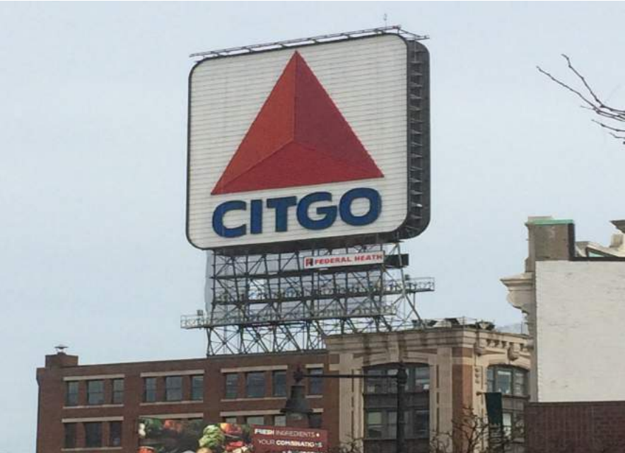
On display during a cloudy Boston day.

Completed: 1940 Address: 660 Beacon Street Creator: Citgo Petroleum Corporation Materials and Use: Neon tubes / Billboard Size: 60ftx60ft (3600ft 2 ) URL: https://www.citgo.com/AboutCITGO/BostonSign.jsp