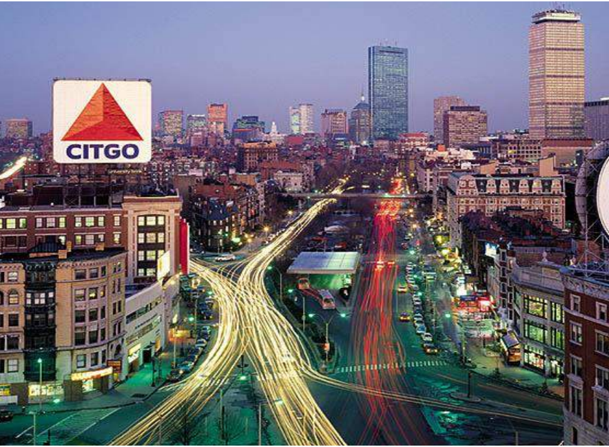
The Citgo sign with the famous Boston skyline in the background.