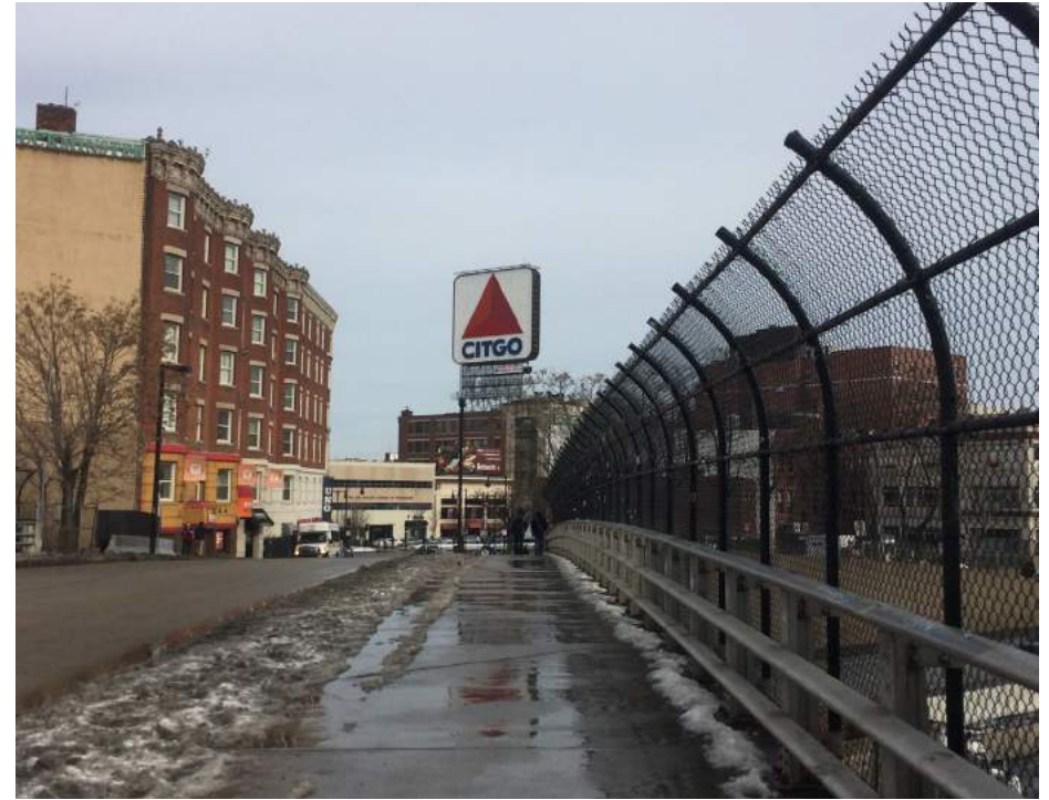
A view looking down Brookline Ave.

Located in the heart of Kenmore Square, a bustling hub for traffic, both vehicular and subway, the Citgo sign has been mounted on top of the 660 Beacon Street building since 1940, a landmark highly visible from all sides and from afar. The mixed-use district offers a rich array of restaurants, pubs and small shops. The area is also home to several academic institutions including Boston University, and the New England School of Photography. The iconic Fenway Park is near-by. This part of the Back Bay Fens is packed with various types of activity and is very accessible from anywhere in Boston.