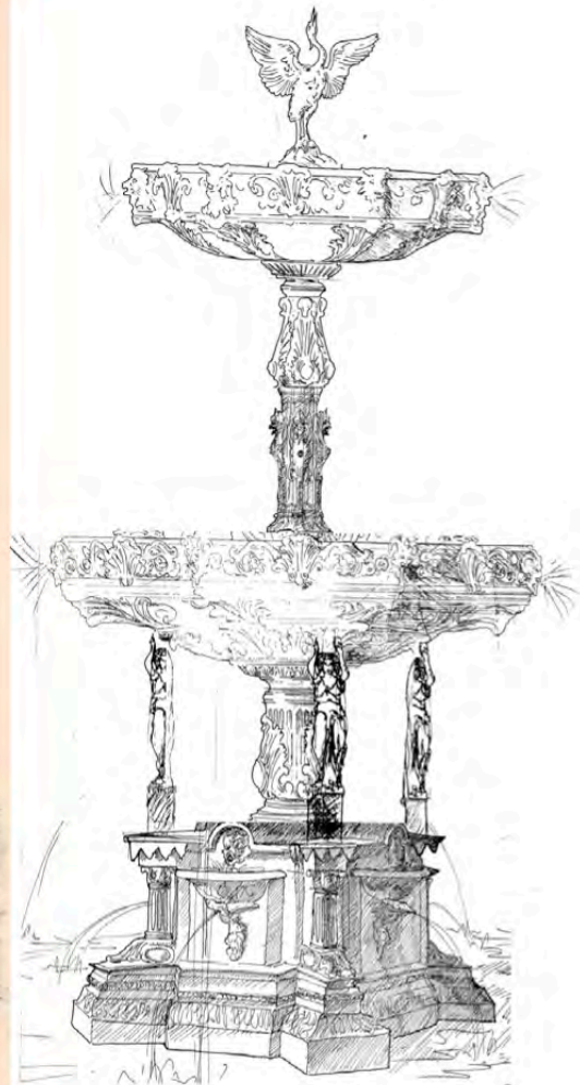
Sketch of Proposed Fountain