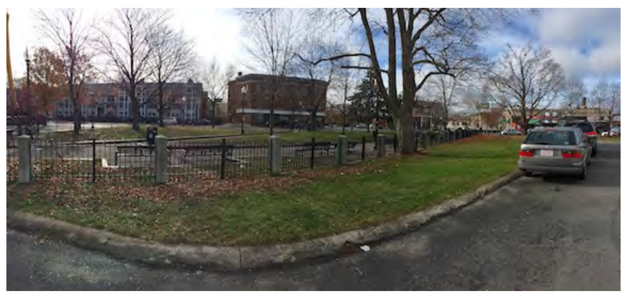
Codman Square Park panoramic view from Centre Street