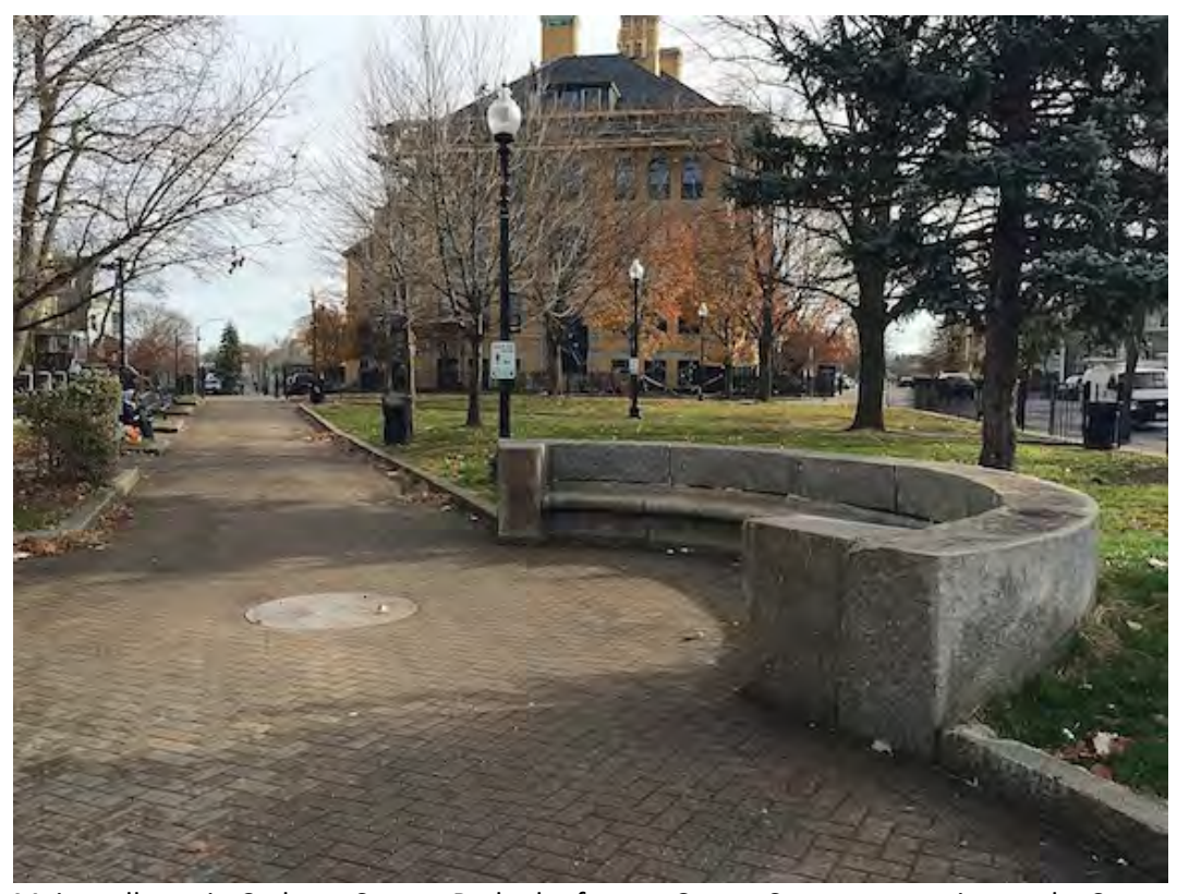
Main walkway in Codman Square Park, the former Centre Street connection to the Square