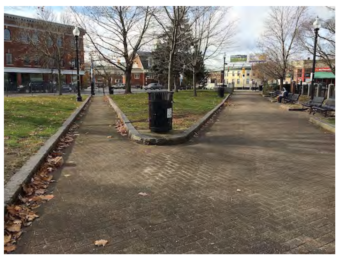
Codman Square Park view from Centre Street toward Washington St. & Talbot Ave. intersection