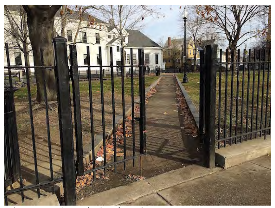
Codman Square Park, view of walkway from Talbot Avenue