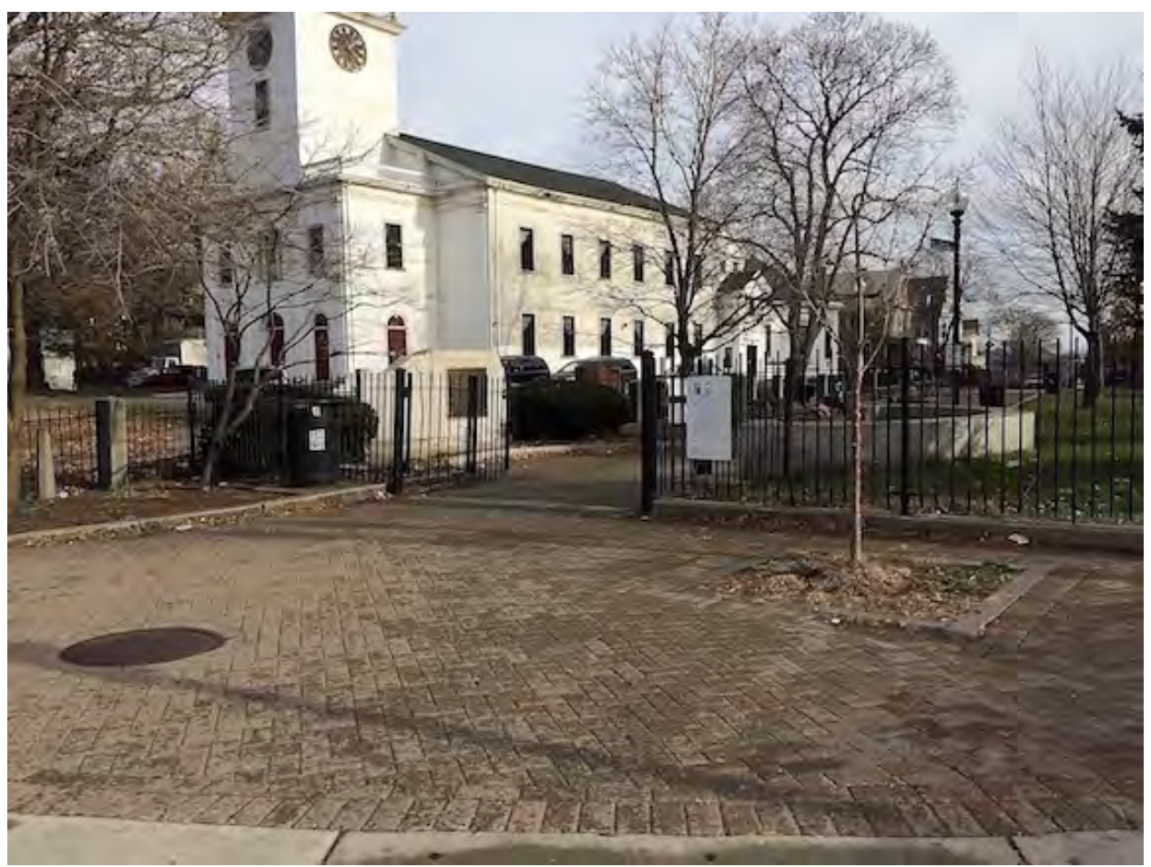
Codman Square Park entrance facing Washington Street, with adjacent Church of the Nazarene Second