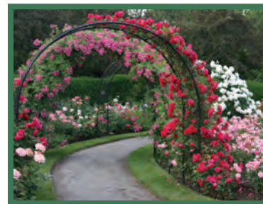
Kelleher Rose Garden