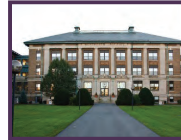
Wentworth Institute of Technology