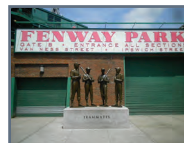
Fenway Park - Teammates