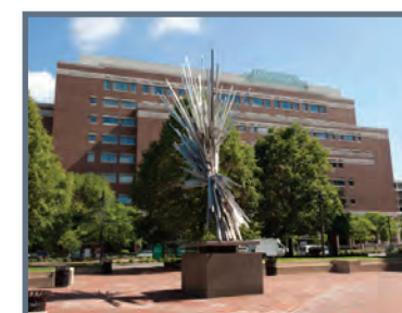
Boston University - Explosion

Produced by: Wentworth Architecture Students