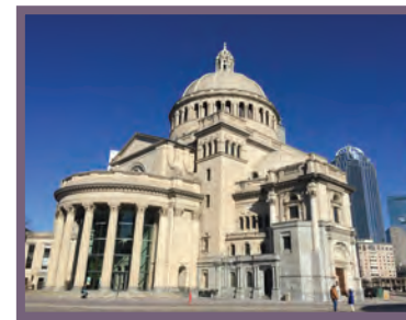
Christian Science Center