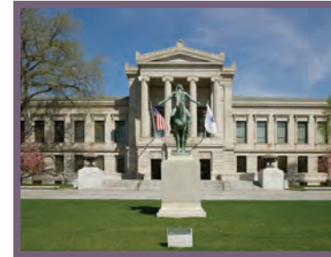
Museum of Fine Arts