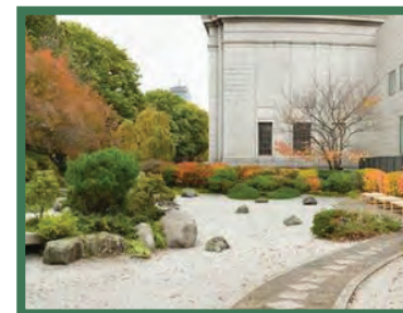
MFA Zen Garden