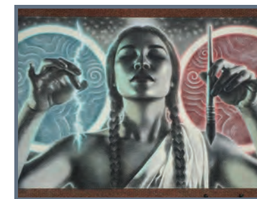
Northeastern University - Ars et Scientia