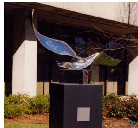
Location: Northeastern University Sculpture Park Title: Bird in Flight Year: 1997 Artist: Leonardo Niermann Media: Stainless steel sculpture

A permanent sculpture park was designed in 1997 as a threshold to the campus. This contemplative environment houses sculptures by various artists.